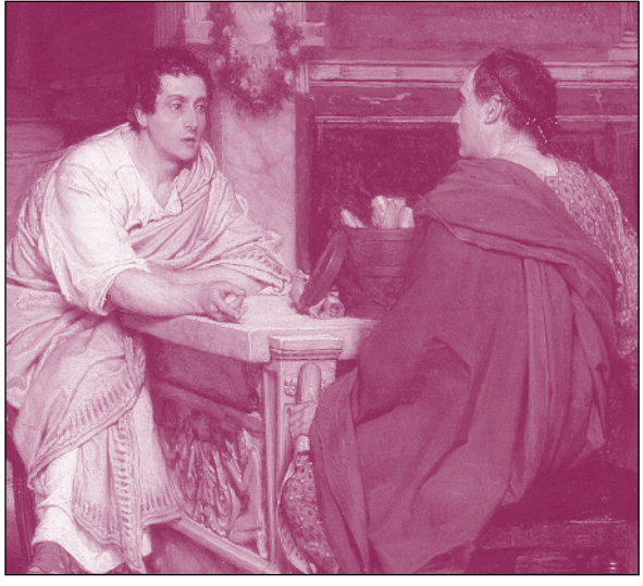
The Discourse by Lawrence Alma-Tadema

Those dear melancholics' fundamental struggle is with an interior sense of goodness. They cannot predicate words like: good, beautiful, special and excellent toward themselves! – In short, they have little capacity to love themselves. Now a typical concern for a traditionalist, in the face of this world of pop spirituality, is whether or not "loving the self" is some horrible form of New Age psychosis. Yet