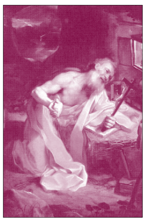
Saint Jerome by Federico Fiori Barocci

With the phrase "love thy neighbor as thyself," the choleric needs to concentrate on the word "neighbor." The choleric soul imagines herself always having everyone's best interest in mind without actually asking him. Or if she